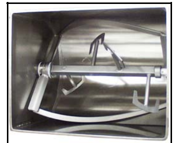
Dual Paddle (Quad)