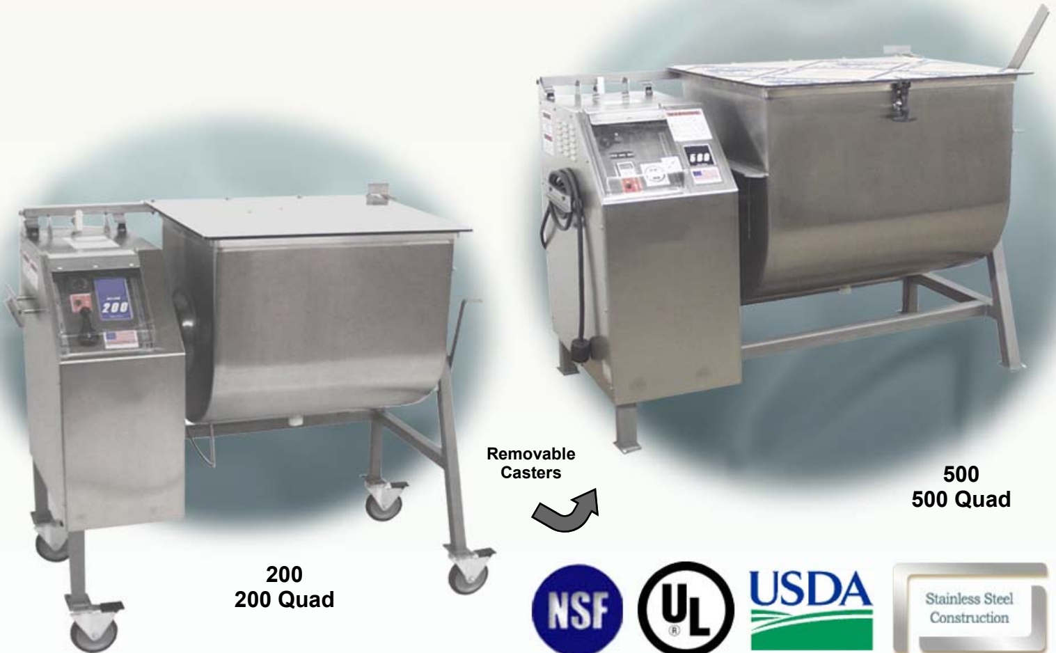
200 200 Quad