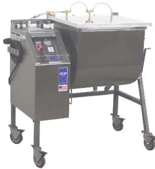
Mixer shown with Vacuum System